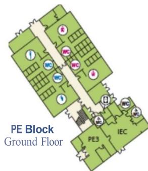
PE Block Ground Floor

On arrival at the Academy please report to the Gatehouse. You will be advised where to park, please then proceed to Reception via the Main Entrance.